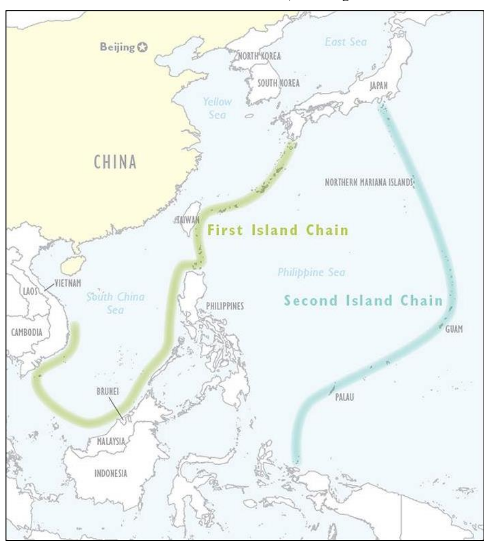
First and Second Island Chains, Showing Guam*

• Chinese analysts over the years have identified numerous other U.S. military facilities, potential facilities, alliances, and even relations with non-allies as supporting the U.S. strategy to encircle and contain China. In geographic terms, some implicate countries on or near the first island chain such as the Republic of Korea (ROK) and the Philippines,<sup>27</sup> and on or near the second, such as Australia (particularly given the new U.S. facility in Darwin) and New Zealand,<sup>28</sup> as participating in this strategy. Some analysts include other regional locations such as Vietnam's Cam Rahn Bay naval base (absent any U.S. presence), the U.S. base in Singapore, and Hawaii.<sup>29</sup> Outside the Pacific, some reference the U.S. military base on Diego Garcia in the Indian Ocean,<sup>30</sup> U.S. security ties with India,<sup>31</sup> and U.S. attempts to "permeate" Mongolia and Central Asian states with political, military, and economic engagement.<sup>32</sup>