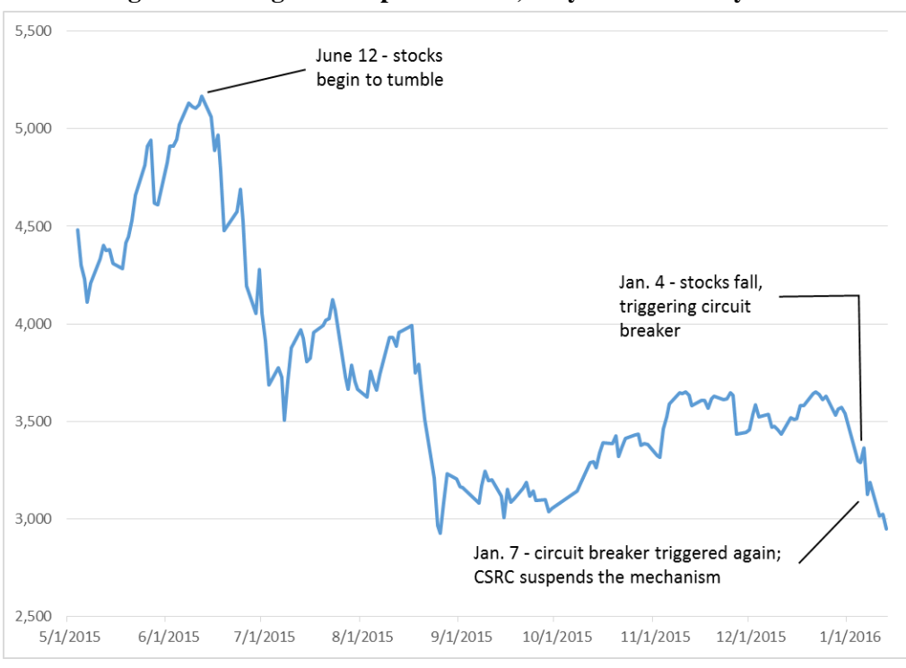
Figure 1: Shanghai Composite Index, May 2015–January 2016

• The new circuit breaker. The mechanism itself fueled panic among investors, who rushed to sell before it kicked in.