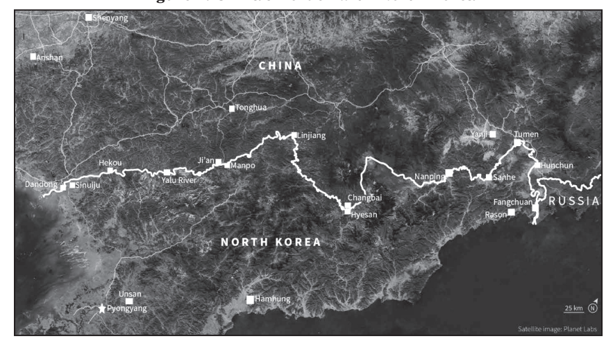
Figure 1: China's Border with North Korea

men River is more easily traversed. It narrows down to points where it is 39 feet wide and less than three feet deep; the long winter in northeastern China means the river is also frozen over for months at a time between November and April. Fences along some parts of the border, which China reportedly began constructing in 2003, would also present obstacles for refugees in transit. Fifteen official crossing points exist along the boundary.